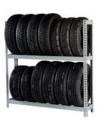
Starter 5x5 Single