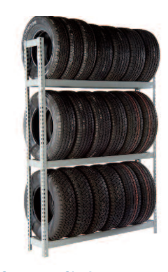
Starter 5x7 Single