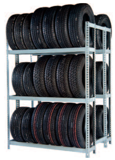
Starter 5x7 Double