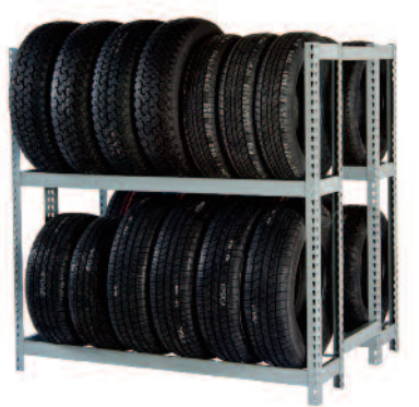
Starter 5x5 Double