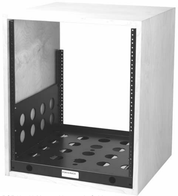
POR194-10 Mounted in sample Cabinet